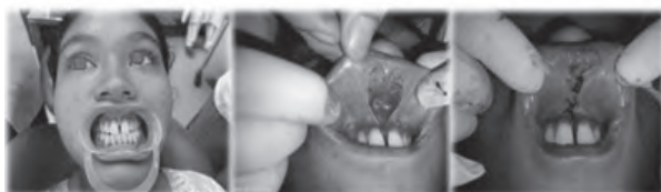
Upper labial frenectomy